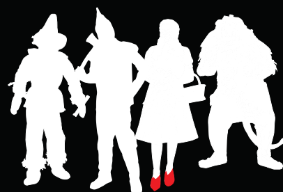
THE WIZARD OF OZ