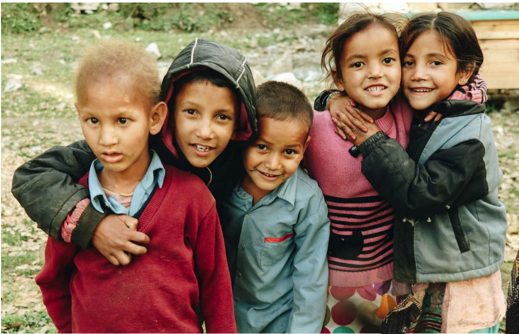
Siblings at the Grahm Camp in Sosan, India “When asked, they told me they were siblings and they love their life out of the city chaos.” —Siddhant Soni, photographer (Unsplash)