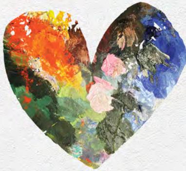
From the Heart: Passages that Inspire Us